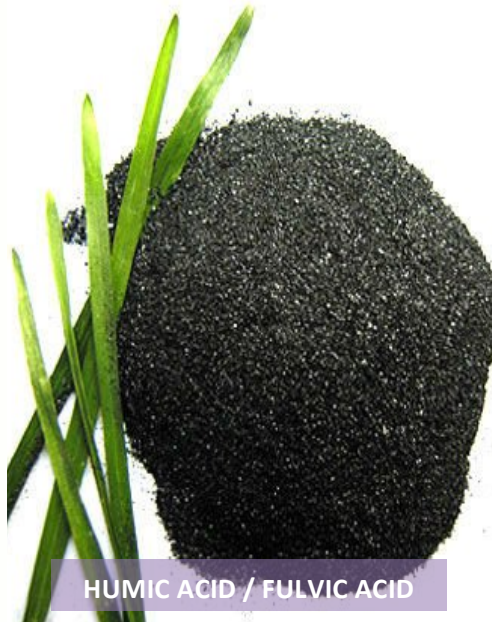
HUMIC ACID / FULVIC ACID